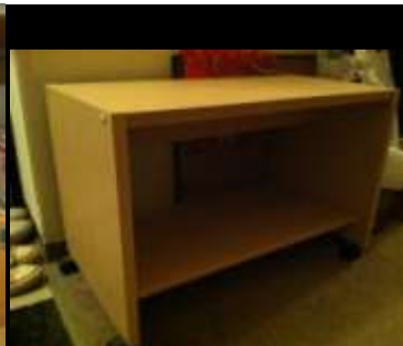
TV Stand: $10