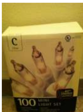
Holiday light: $5