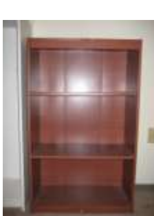
Book shelf: $5