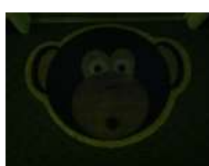
Monkey doormat: $5