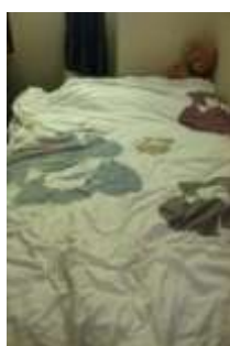
Full size bed + box spring: $55