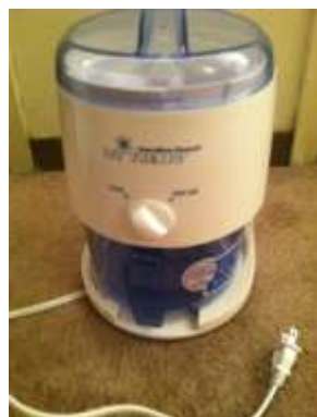
ice treat (Bing su machine): $10