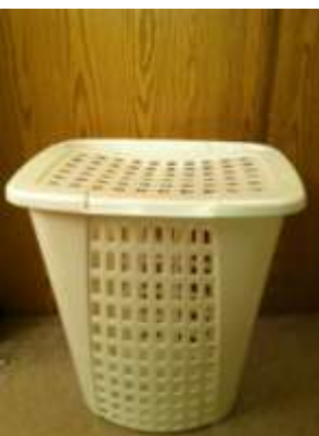
Laundry basket: $5