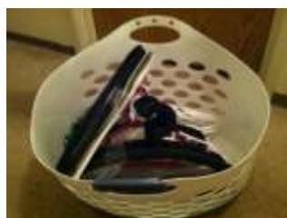
Laundry basket w/ hanger: $7