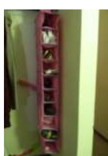
Shoe rack: $7