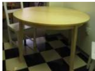
Kitchen table w/ two chairs: $35