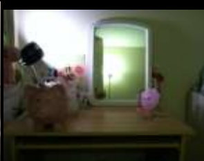
computer desk, ramp: $20