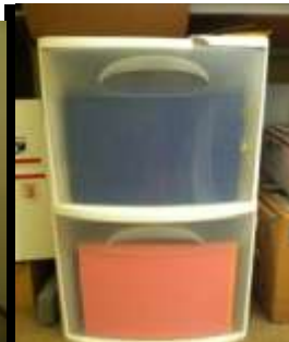
cabinet(2 floor, 4floor): $2 EA