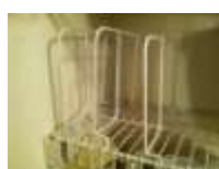
Floor ramp1: $10,