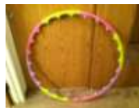
Hula hoop: $3