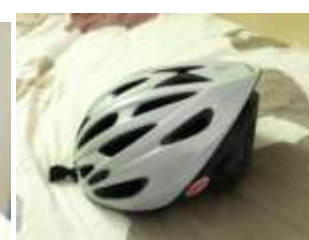
Bike Helmet: $7