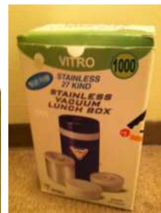
Stainless lunch box: $10