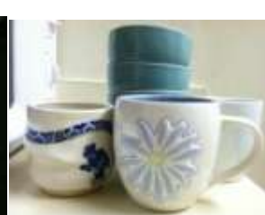
Cups(3), bowls(6), plates: $5