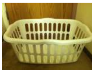
Basket(white, navy color): $3 each