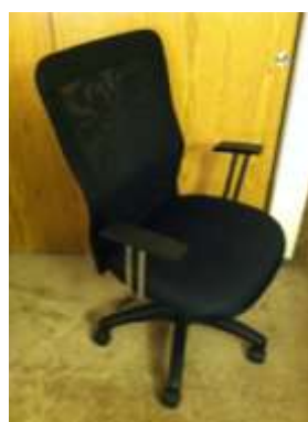
Office Chair: $7