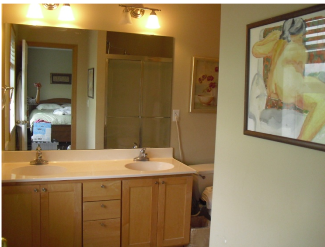
Full master bathroom with a shower booth