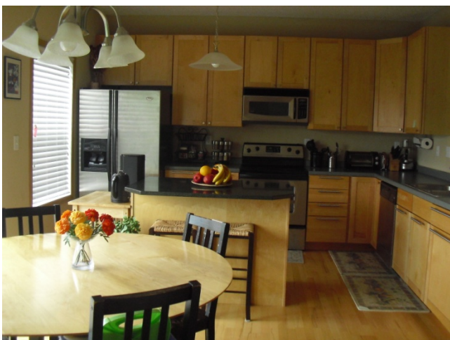
Kitchen featured with maple cabinetry, center island, pantry, stainless steel appliances, and a sliding glass door to the deck