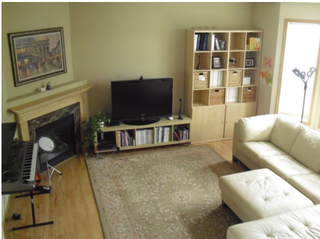
Spacious living room (19'7X17'5) with a maple laminate floor, 3 sunny east-facing windows, and a fire place