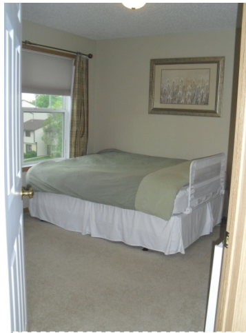
2 nd bedroom with built-in closet