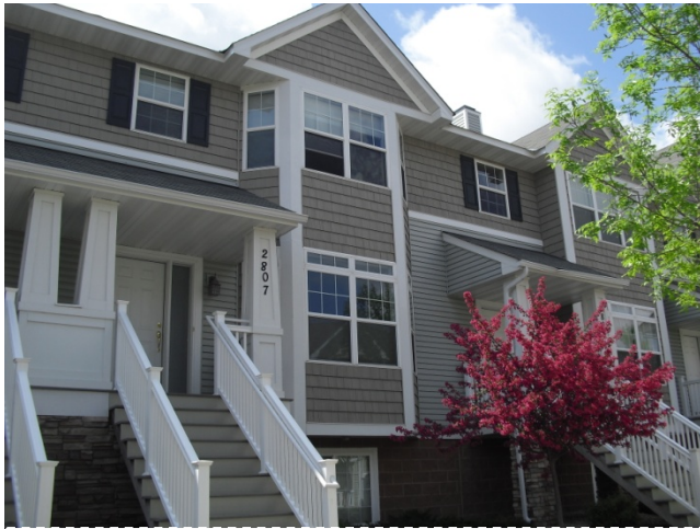
2004 Townhouse (1616 sq. ft.) with 3 bedrooms, 2 ½ bathrooms, & 2-car attached garage