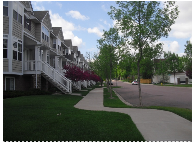
Located on a quiet street close to neighborhood parks, Rosedale and HarMar Malls