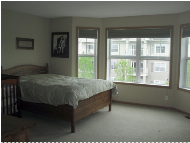
Master bedroom with walk-in closet