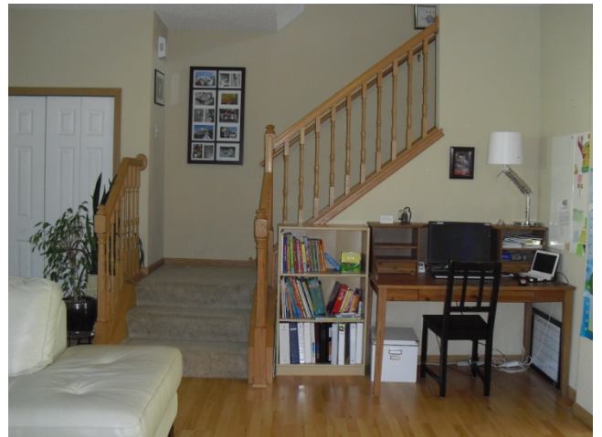
Stairways to the upper level