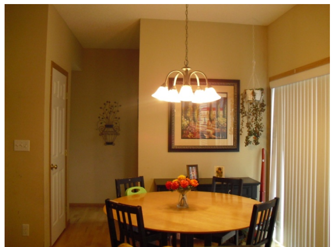
Dining area with a half bathroom and an access to the lower level (garage & guest bedroom/office)