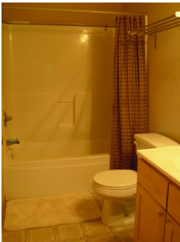
2 nd full bathroom with a bathtub